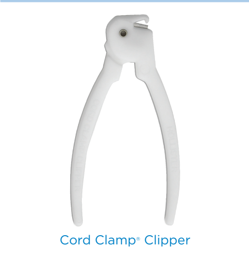
Cord Clamp® Clipper